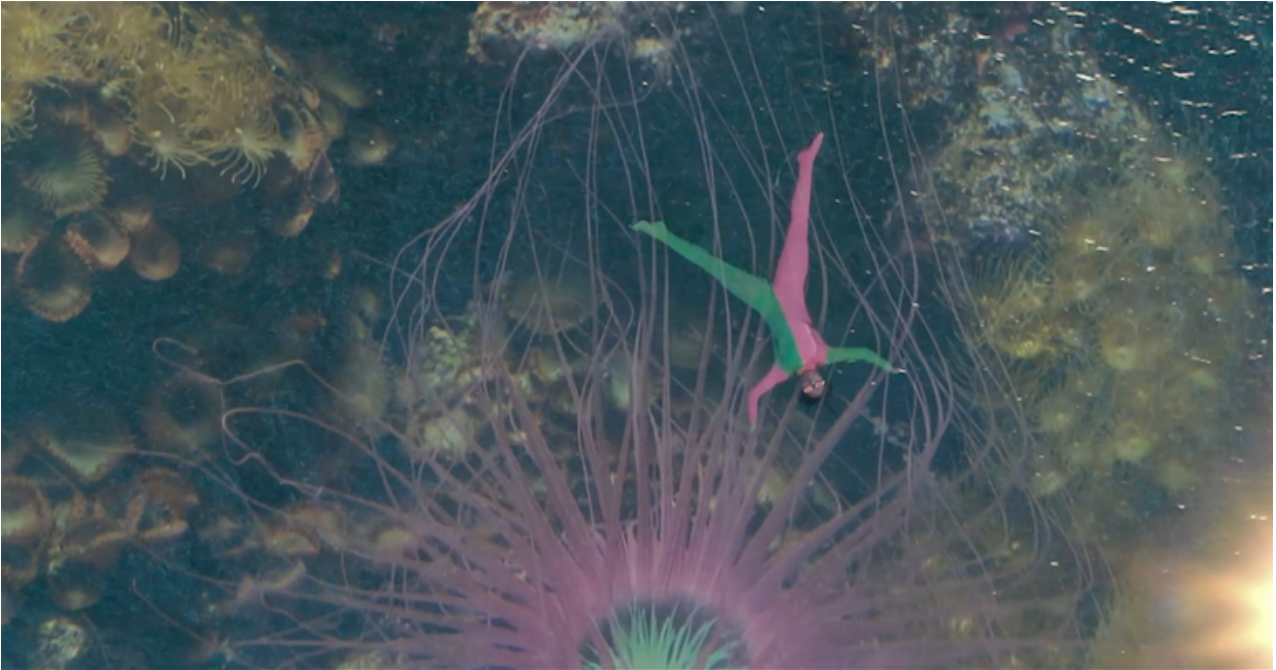
Synchronized Serpent , 2020 Video, colour, 4K, sound