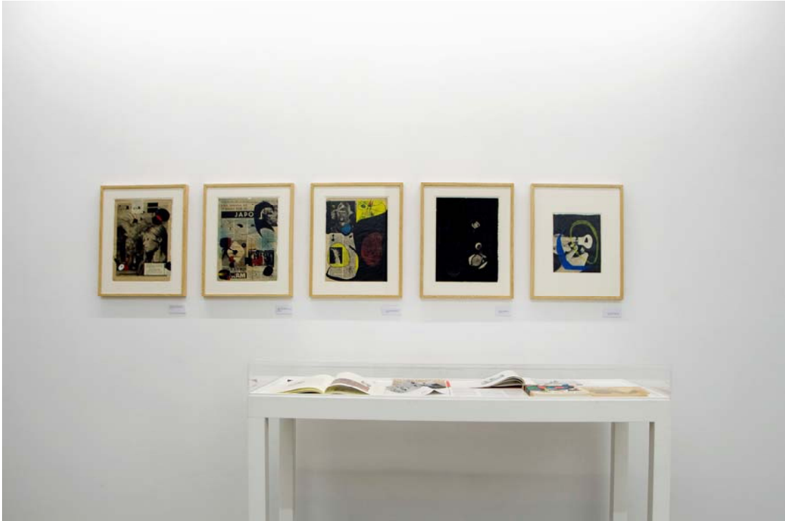
General exhibition view