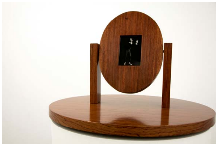
Pep Agut Rescue attempt. Nonsense , 1994 Wood, b/w photographs, glass, cylindrical base and rotary platform. 157 x 63 cm.