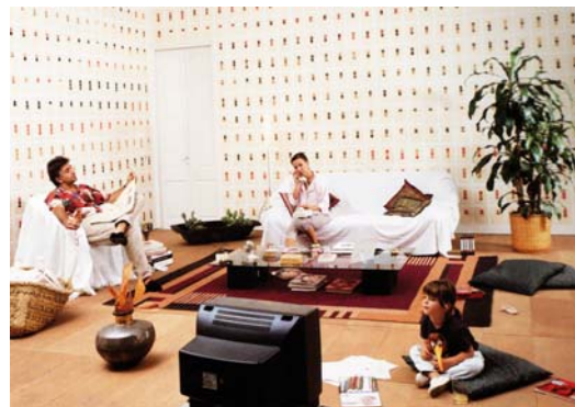
Detail: S/T (Exact rooms: Livingroom), 1989

S/T (Habitaciones exactas: Dormitorio/ Exact rooms: Bedroom), 1989 Framed color photograph and methacrylate. 100 x 150 cm.