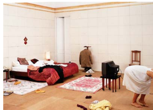
Detail: S/T (Exact rooms: Bedroom), 1989