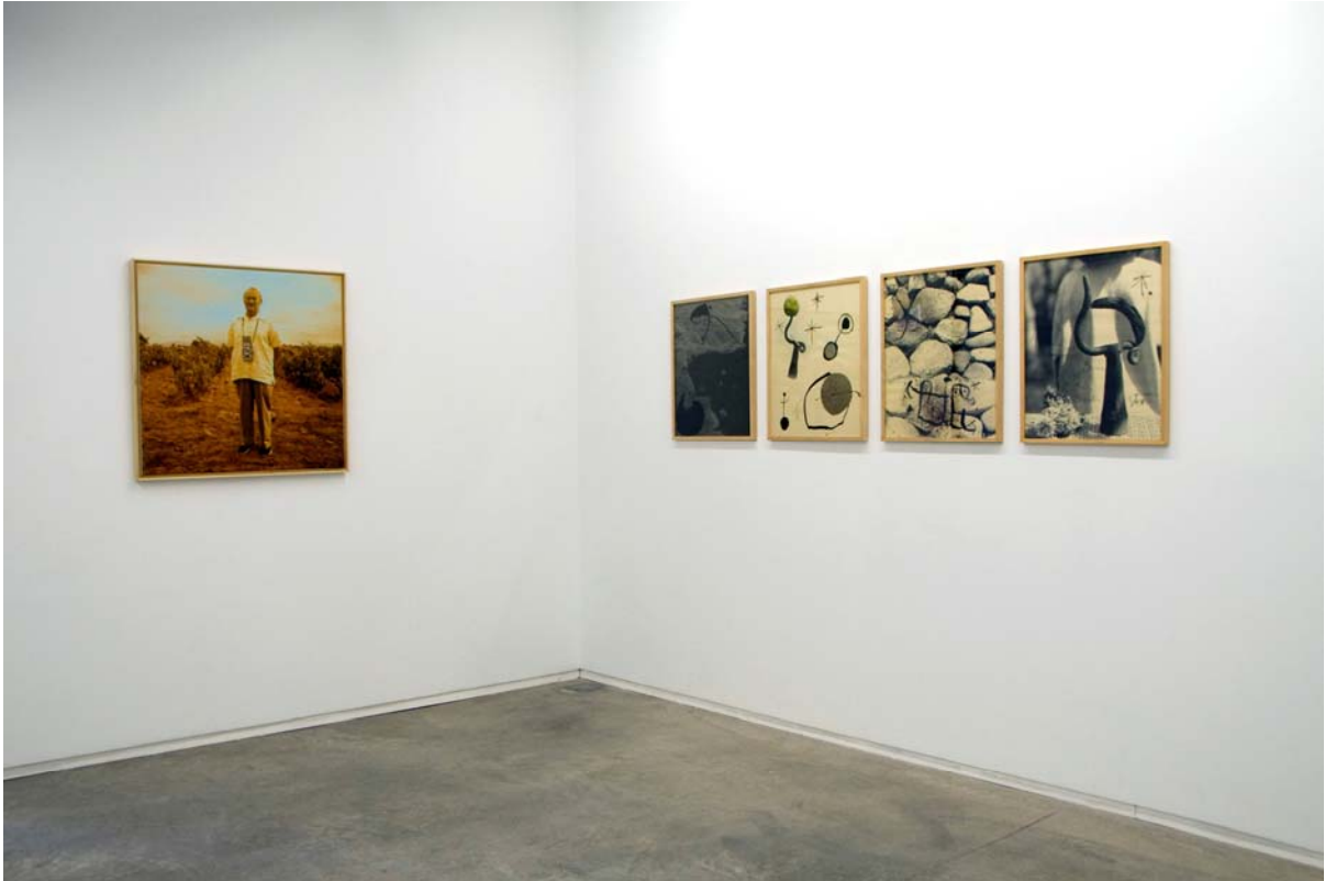
General exhibition view