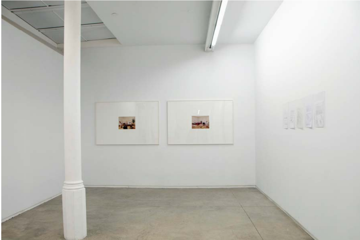
General exhibition view