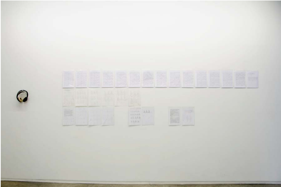
General exhibition view