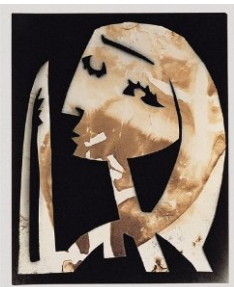
Cover from The artist and the Photographer , Editorial Actar, 2000

Collages elaborated with newspaper cuts in which photography plays a very important role.