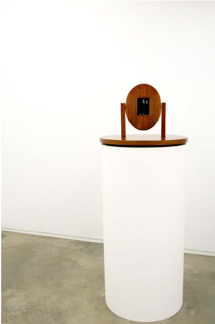
General exhibition view