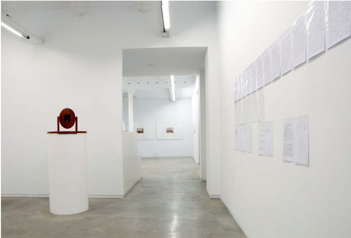
General exhibition view