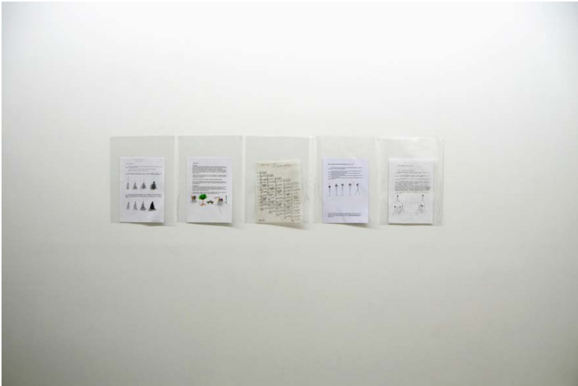
General exhibition view