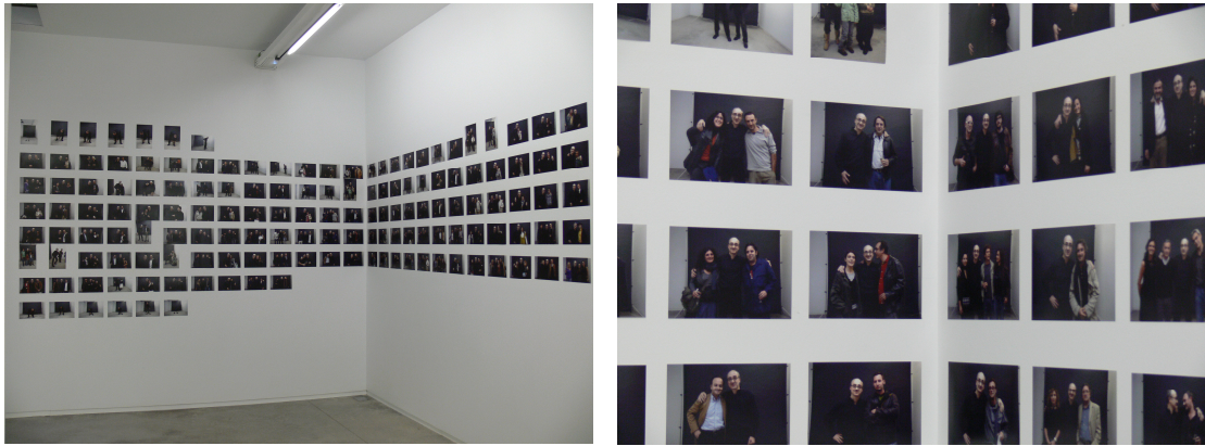
Installation views after the performance with the photographs taken during the opening. àngels barcelona, 2007.