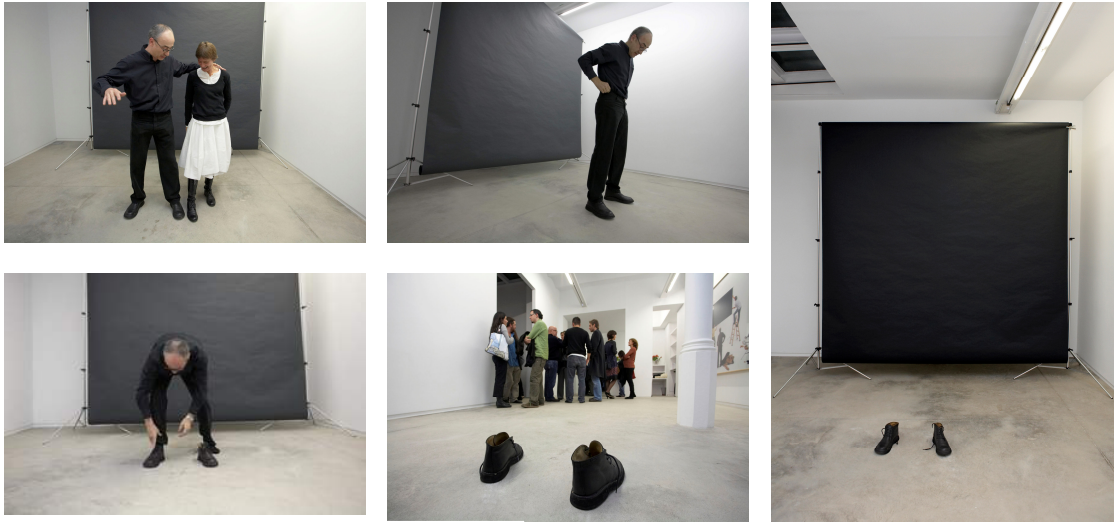
Partial views of the performance. àngels barcelona 2007

After signing, barefoot, the contract "Hercules", the artist places himself in the shoes nailed to the floor; he remained in the shoes throughout the two hours of the official inauguration, posing for the photographer with those that wished to have their picture taken and giving personal explanations of his work.