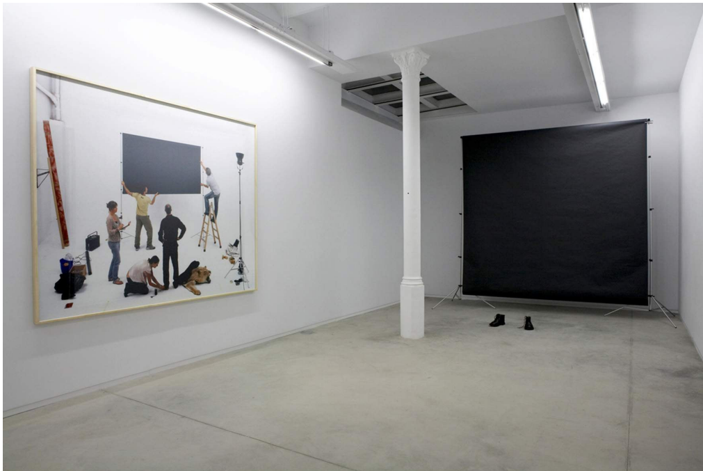
Partial views of the exhibition, àngels barcelona 2007

The project is composed of three pieces realized in very different media; as is characteristic of the artist's work, it negates any limiting notion of style. The show will include a photographic work, Hercules spectacularizing himself , which portrays the artificial production of the “Hero” in society. In addition, the artist will interpret a performance, Public Hercules , throughout the duration of the opening; the material generated from this piece will then be exhibited. The third work is Hercules (A self portrait losing economic value and gaining cultural capital) , the title piece and central element to the project. Hercules is a work of art and, at the same time, a legal contract. Directed to the collector, this work guarantees the initiation of a process that will bring about its complete depreciation in terms of its exchange value, while at the same time it is reevaluated as a cultural product.