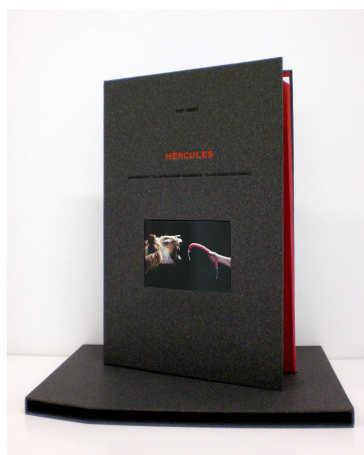
Contract's folder and cover.