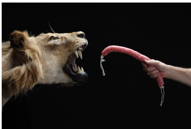
Colour photograph at the cover of the contract. 10 x 6.5 cm